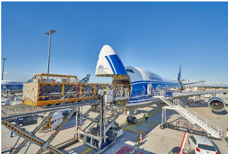
Loading at Airport Frankfurt, Germany

With the Bögl Transport System, Max Bögl has developed a future-oriented local transport system based on magnetic train technology. It is quiet, flexible, low-emission, space-saving and reliable. The Bögl Transport System works with a linear drive, and thanks to flexible routing, can be integrated into existing transport infrastructure. As a turnkey supplier, Max Bögl is responsible for planning, industrial production of the track and vehicle, and construction measures. This is resource and cost-efficient, which makes it possible for the infrastructure project to be completed quickly.