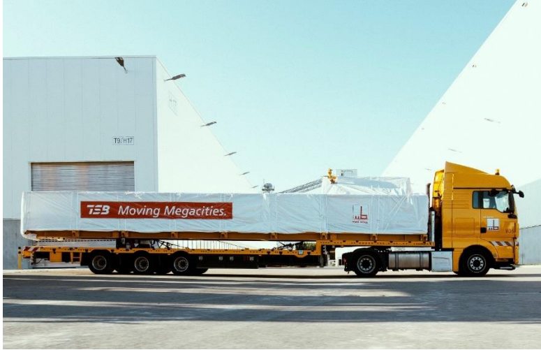
Truck transport from the factory in Sengenthal